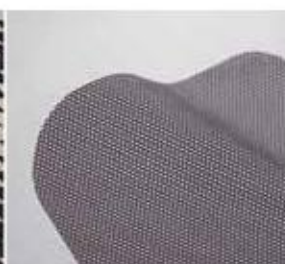
5 Awning materials coated polyester, cotton.