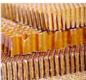
2 Honeycomb boards from paper, cardboard, plastics or aluminum.