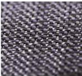
1 Carbonfiber woven, knitted or uni- directional textile structure. Single and multi-ply.

series for customers with the most stringent quality requirements... You are confronted with the challenges of producing light-weight building products in large quantities... Zünd can offer you a modular, flexible, cost-effective expandable cutting system for processing various materials with impeccable precision.