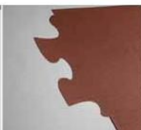
4 Prepreg pre-impregnated fiber. Semi-finished product of carbon or glass fibers and a non-hardened duro- or thermoplastic matrix.