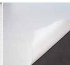
5 Filter materials felt, synthetics, carbon, paper.