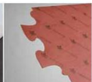
6 Gasket materials paper, graphite, rubber, silicone, cork.