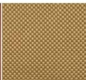
5 Aramidfiber Kevlar™ woven, knitted, or uni-directional textile structure. Single and multi- ply.