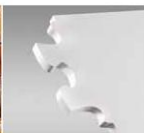
3 Structural foam core-, sandwich- materials.