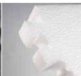
4 Foam material polystyrene, polyurethane, polypropylene.