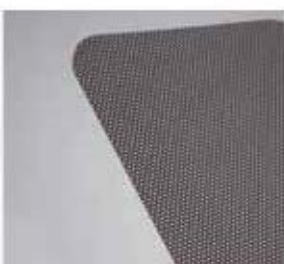
2 Garment fabrics cotton, polyester, velour, net, toweling materials, spacer- or micro fabrics.