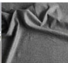
3 Stretch fabrics elastane, spandex, spacer fabrics.