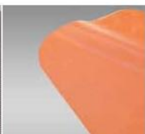
3 Rip-Stop reinforced nylon fabrics.