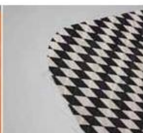
4 Balloon materials silk, polyester, polyamides.