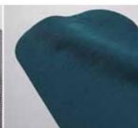
6 Felt materials non-woven cotton or synthetics.