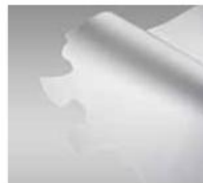
1 PVC film printed or unprinted.

Zünd cutters come in working widths up to 3.2 m/125". Automatic material-handling options, such as the center winder and a range of other roll-feed devices, facilitate processing of unwieldy and large-format rolls, e.g. PVC-film for truck tarps. Digitally cutting these flexible materials is significantly faster, more reliable, and reproducible than cutting them by hand. This results in maximum productivity.