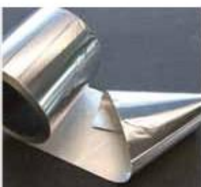
2 Metal foils aluminum, copper foil.