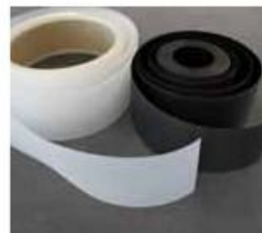
1 Synthetic materials PE, PP, PUR, PVC.

Standardized and open interfaces allow for integration in any production workflow. Zünd Cut Center software is compatible with a broad range of file formats and can be integrated with other software platforms. Zünd offers robust, proven and thousand times installed cutting technology for industrial applications.